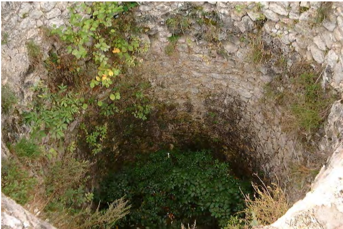
Figure 12: Pictured below is the Travnik castle well, perhaps the deepest of all. Allegedly, its upper portion was modified to a jail in Ottoman times – which clearly speaks about its dimensions. It can be seen that it has never been plastered, which means that it was not meant to be waterproof – the same stands for all other wells in the region.

the Gibeon well is world famous, but nobody knows about this one!