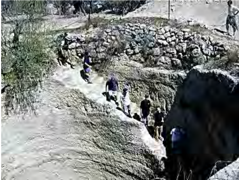
Figure 3: the Gibeon well

The water wells of Gibeon and Beersheba, and huge cisterns of Masada in what is now Israel, are a total puzzle to modern hydrogeologists.