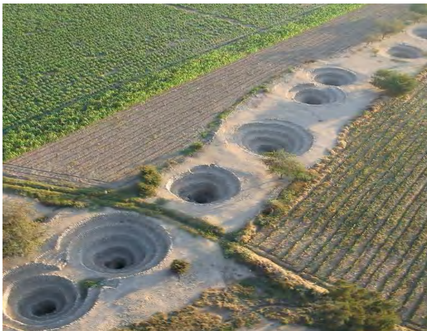
Figure 2: a Nazca aqueduct

2500 years ago Nazca people built a water system at Cantalloc (Cantayo), consisting of deep aqueducts and access wells, which are still in use. There are several such systems in the area, and essentially they resemble the Qanats.