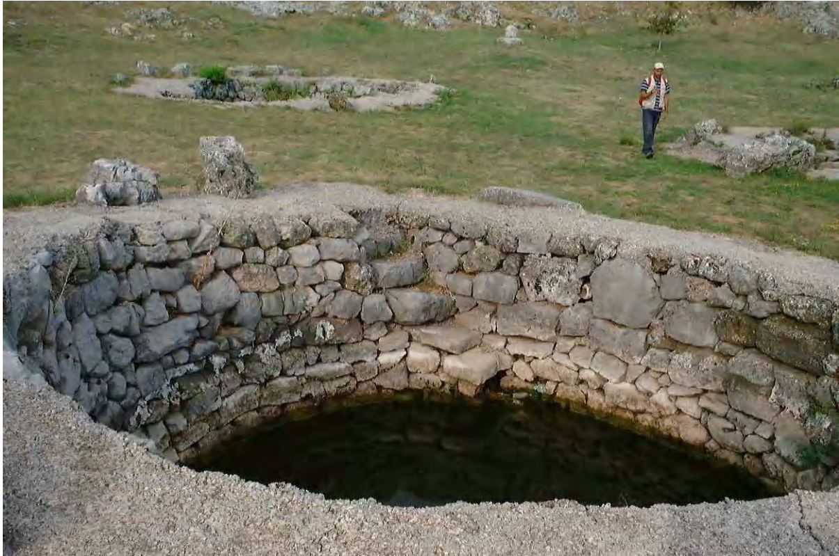
Figure 6: One of seven clustered wells at a location in Herzegovina area. Nobody knows their age and purpose...