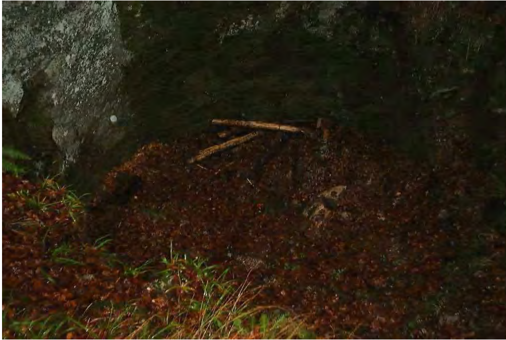
Figure 11: The Kozograd well above Fojnica has been cut in solid rock, with masonry toward the slope. Locals say that it is more than 20m deep, with stairs spiraling down. If the well was not filled in, it could easily be seen that it is very similar to the Gibeon well - with a huge distinction:

the Gibeon well is world famous, but nobody knows about this one!