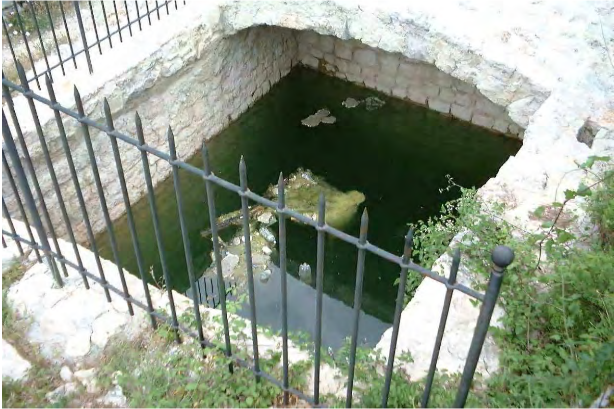
Figure 9: Similarly, the well at Ljubuski fort is always full, like a pool. According to locals, its depth has never been measured successfully – because of strange swirls at its bottom! When I mentioned this to a professor emeritus who is still the foremost authority on geology and geomorphology of this country, he immediately agreed that it could not possibly be a cistern.