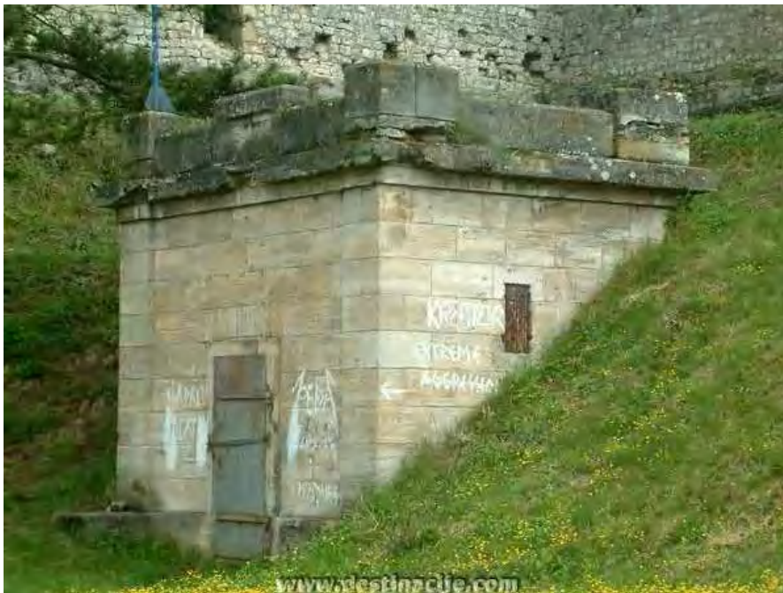
Figure 10: During Austro-Hungarian rule, this water station has been built within the Jajce castle, on the top of a hill. The water still supplies the Upper town. A local said that the water has originally been brought from another hill by means of underground tubes, but not a single trace of them has ever been seen. The source of water, most probably a well, had apparently existed before, and we can rightly assume that it was just captured later.