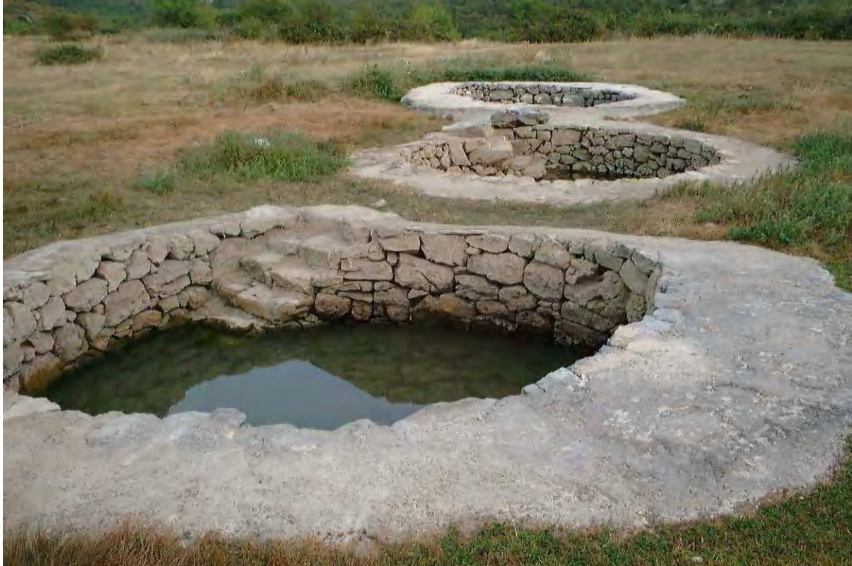
Figure 7: Another cluster of wells in the same area, and the same mysterious purpose

There are more than 250 castles in what was known as Bosnian kingdom. With a few exceptions, they are placed on hilltops and ridges, high above valleys. Most of the castles are in poor condition now, but within their confines, cylindrical or rectangular stone-lined shafts can be found. Conventionally, they are recognized as cisterns for collecting rainfall, but in fact they are wells.