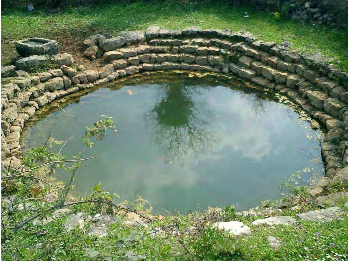
Figure 5: The famous Neveš well at Boljuni in Herzegovina