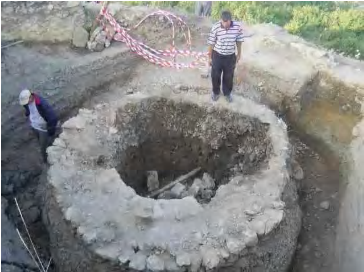
Figure 14 (below): This is how a freshly renovated 'cistern' at the Blagaj fortress looks after the experts' intervention. Hopefully this will be the last and only intervention of this kind – sadly, it is most probably too late to return this well to its original state.

Figure 13: Recently unearthed well of the Visoki royal fortress, on the top of the controversial, pyramid shaped hill (Bosnian Pyramid of the Sun) above the town of Visoko. The site was also inhabited during Illyrian and Roman times, and probably hides more secrets. The photo was taken before a serious damage was inflicted by a storm. Having its inner diameter in mind, it is hard to believe it served as a cistern.